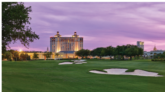
The Westin Savannah Harbor Golf Resort & Spa.

The Westin Savannah Harbor Golf Resort & Spa, originally booked for the 2021 Annual Meeting that was cancelled due to COVID, is easily accessible to the Savannah International Airport. Nestled on the north bank of the Savannah River, the Westin is a short but scenic water taxi ride to downtown. The resort is home to a new tennis complex, luxurious spa, a year-round heated pool overlooking the river, and a challenging golf course that was a stop on the PGA senior tour. To relax you may take a stroll in town and wander the prettiest street in America, explore numerous roof tops, dine at popular restaurants or drive 30 minutes to reach the Atlantic Ocean.