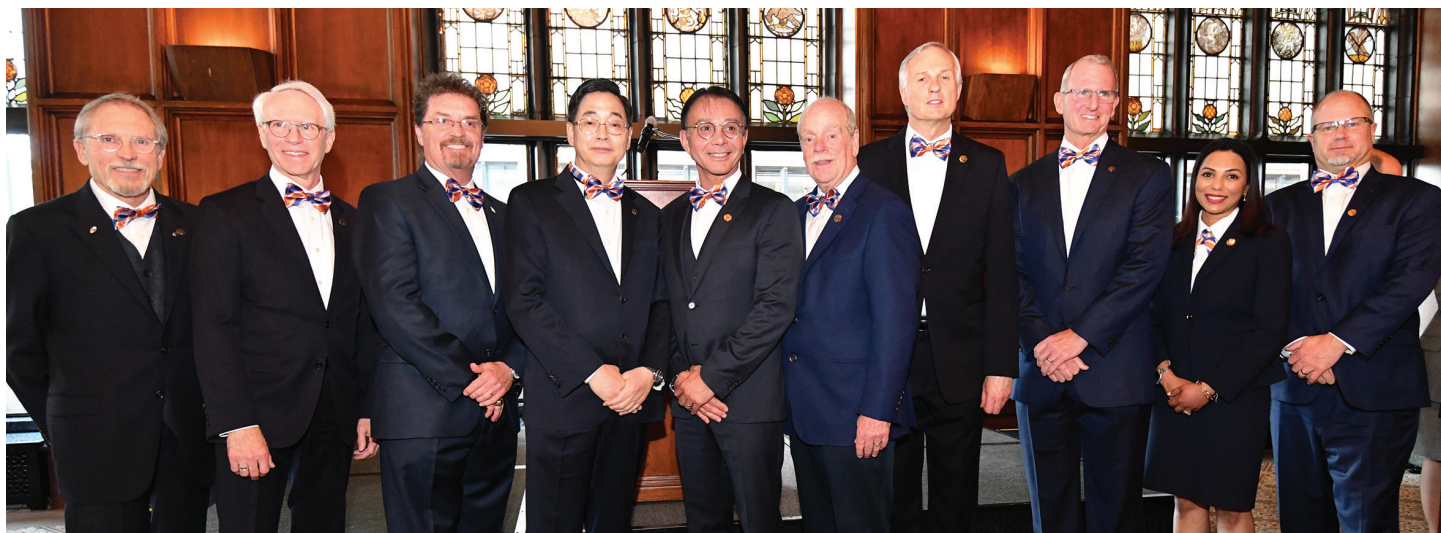
ABO Directors at ABO 2023 Awards Night.