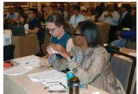
Prep course attendees in group lectures at the College Annual Meeting.