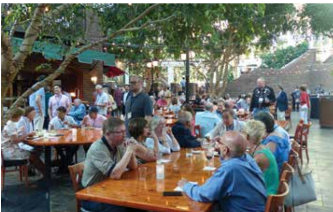
Meeting attendees enjoy opening night group dinner.