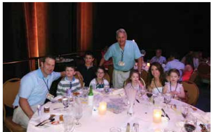
Three generations of the Crawford family.