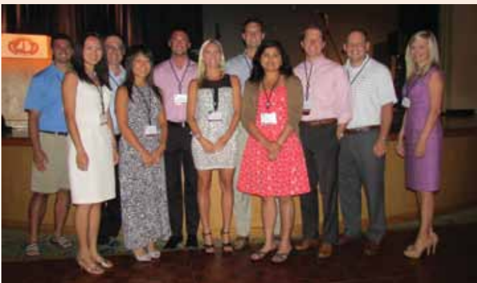
Residents in Bermuda.