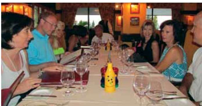
Councilors at dinner in Bermuda.