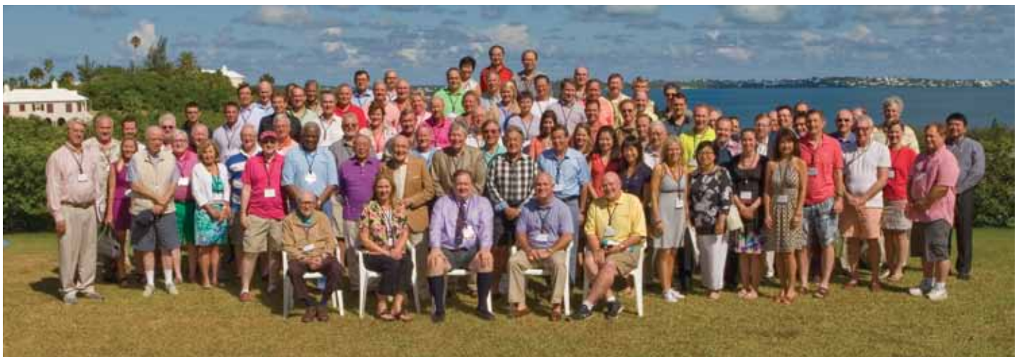
Generations of orthodontists came together in camaraderie to learn from each other.