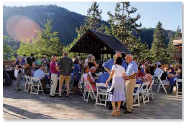
Attendees at opening reception.