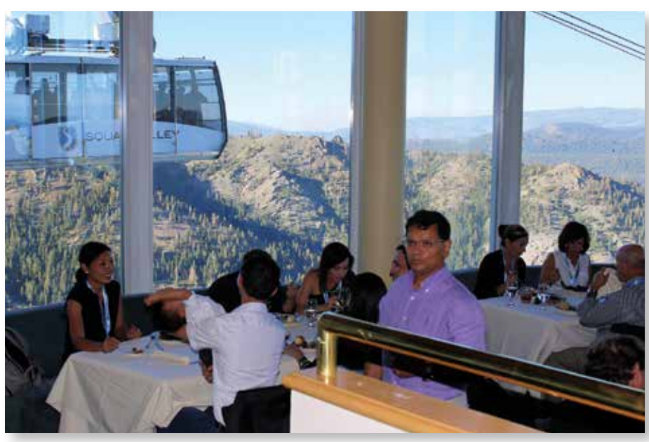
Meeting attendees enjoy group dinner and entertainment at High Camp at top of Mountain.