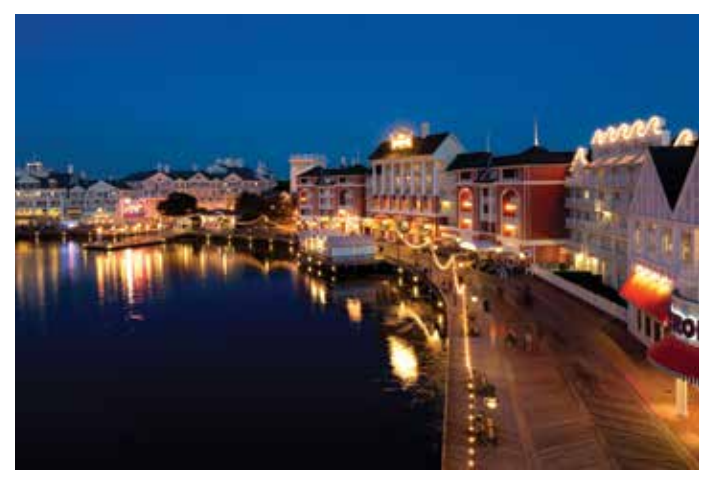
As to Disney properties/artwork: © Disney