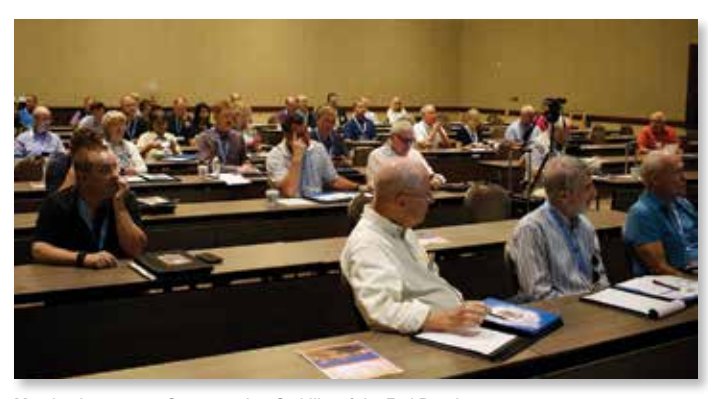
Morning lectures on Controversies: Stability of the End Result.