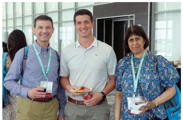
Members of team Virginia Commonwealth who took third place at CDABO Resident Case Display program.