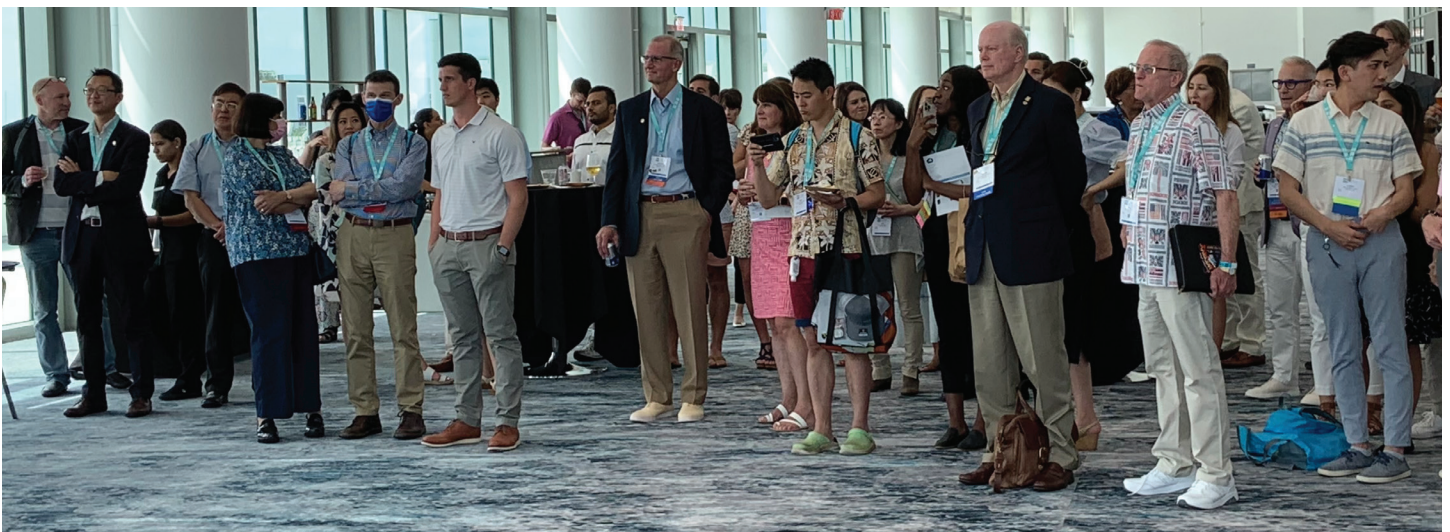
Attendees at College Member Reception.