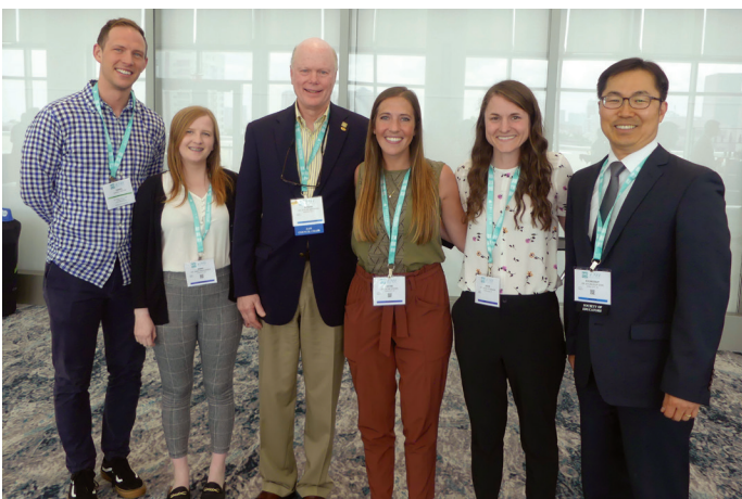
Members of team University of Iowa who took second place at Resident Case Display program.