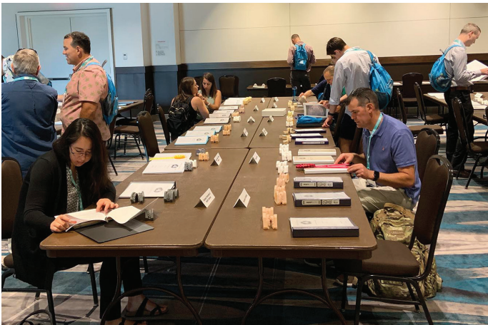
CDABO Resident Case Display program.