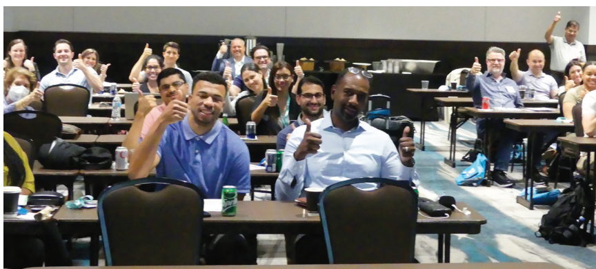
Prep course attendees give an overwhelming "thumbs up" to the prep course curriculum.