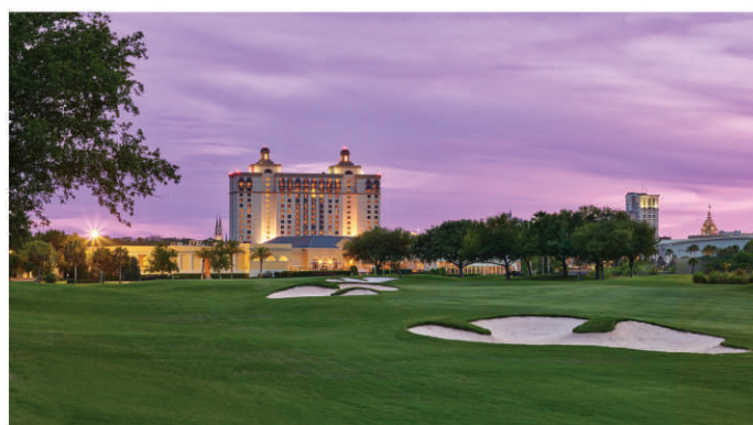
The Westin Savannah Harbor Golf Resort & Spa.

The Westin Savannah Harbor Golf Resort & Spa, originally booked for the 2021 Annual Meeting that was cancelled due to COVID, is easily accessible to the Savannah International Airport. Nestled on the north bank of the Savannah River, the Westin is a short but scenic water taxi ride to downtown. The resort is home to a new tennis complex, luxurious spa, a year-round heated pool overlooking the river, and a challenging golf course that was a stop on the PGA senior tour. To relax you may take a stroll in town and wander the prettiest street in America, explore numerous roof tops, dine at popular restaurants or drive 30 minutes to reach the Atlantic Ocean.