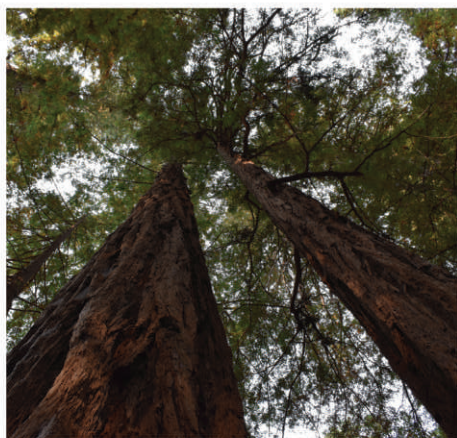
Armstrong Redwoods State Natural Preserve.

I am looking forward to seeing you at this beautiful location next summer! Please be on the lookout for registration information, which will be distributed to College members in early 2022.