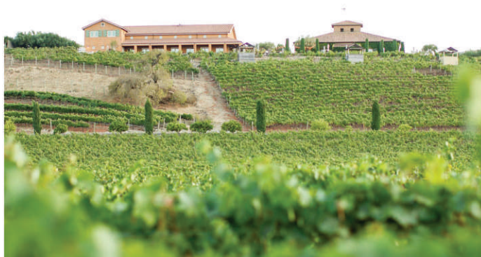
The President's Dinner will be held at Viansa Winery.

As you can imagine, there are an almost endless number of vineyards and tasting rooms to visit in the immediate area. The College and the Inn will help set up several options to visit them: shuttle, trolley, train, electric bikes, or by driving a short distance. Close by are the foodie havens of Healdsburg and Petaluma, and the vineyards of the Russian River, Dry Creek, and Alexander Valleys. For beer connoisseurs, the home of the famed Pliny the Elder is nearby at the Russian River Brewing Company.