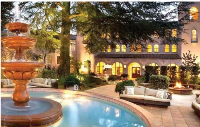
The historic Fairmont Sonoma Mission Inn & Spa.