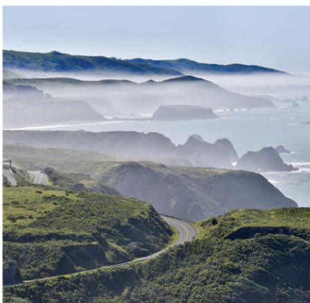
Foggy morning at Bodega Bay.