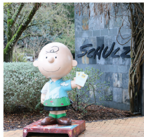
Charles Schulz Museum.