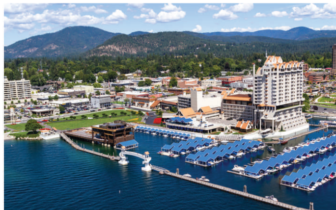
Coeur d'Alene's prime lakefront location, luxurious amenities and world class service make it a special vacation spot.