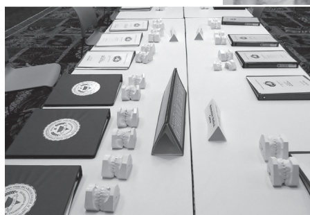
Above: Cases are set up in the College Resident Case Display room. Right: College Councilors teach the board certification prep course.