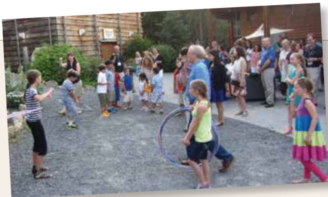
Both kids and adults enjoyed the hula hoop contest.