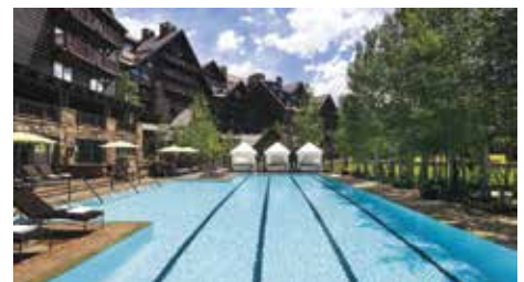
Amenities at the Ritz-Carlton, Beaver Creek.