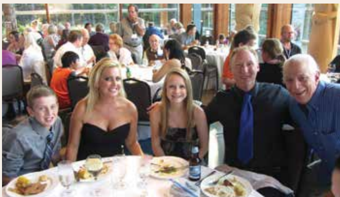
Good food, family and friends at the cultural center.

Again, my sincerest thanks to all who helped make this year's reunion a success, and that includes all of you who brought your families to a breathtaking location while learning from the best in our specialty. My time, from joining the Council to now being your immediate Past President, has passed very quickly!