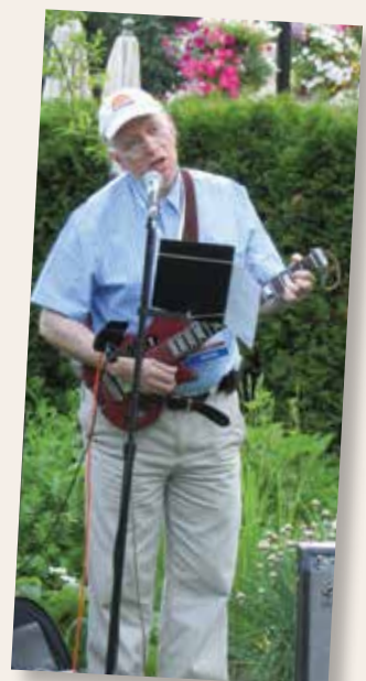
2014 meeting attendees (left).