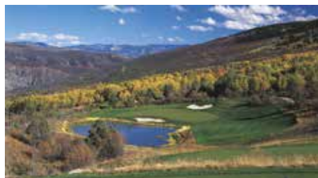
Golf on site at the Ritz-Carlton, Beaver Creek.