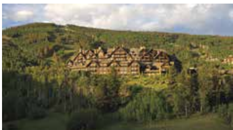
View of the Ritz Carlton, Beaver Creek.

Beaver Creek Mountain offers an unforgettable escape in the heart of the majestic Colorado Rocky Mountains.