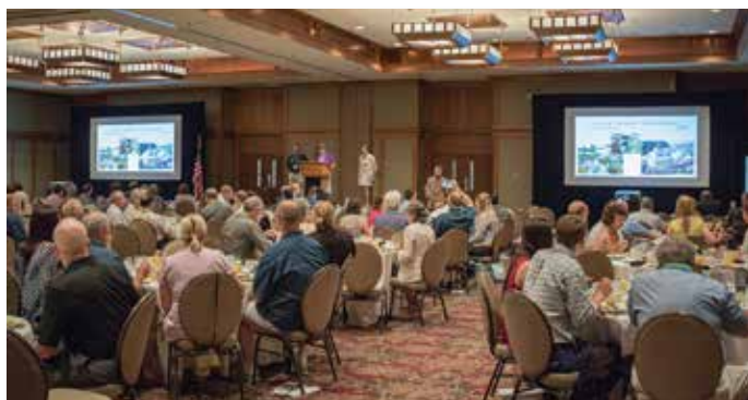
Meeting attendees enjoying group breakfast.

in Asheville residents from every program in attendance replied in writing that they enjoyed the College meeting and they were grateful to the College for the opportunity to attend. Hopefully we helped motivate them to become board certified and College members. Good luck to all these fine future orthodontists! The cost to support the attendance of the residents came from vendors and we are grateful for their support.