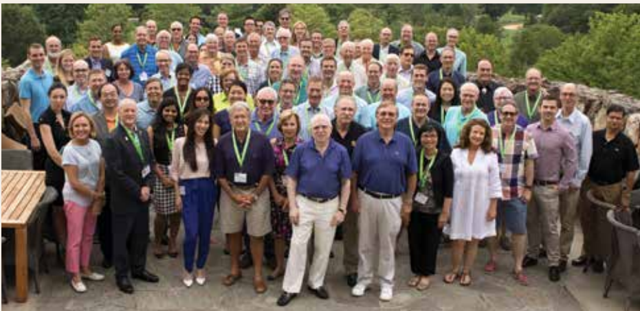
2016 College Meeting Attendees.