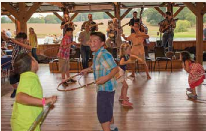
Annual hula hoop contest.