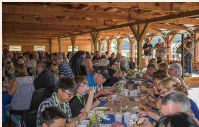
Meeting attendees enjoying group dinner and entertainment.