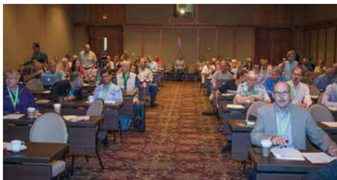
Morning lectures on Cutting Edge Technology.