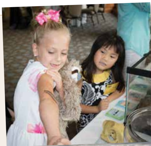
Getting up close with nature at the popular Children's Program.