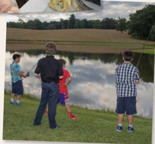
Young attendees enjoying fishing as part of the Children's Program.